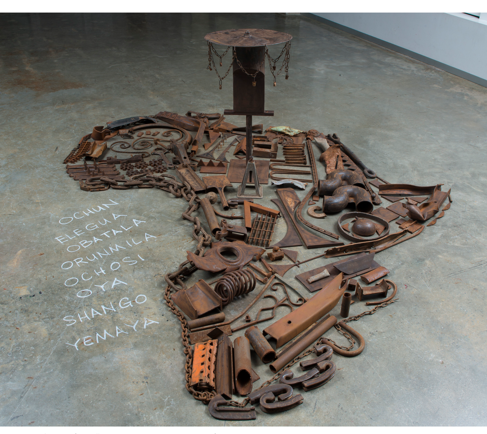
Inclusion of installation requires LSU Museum of Art courier.