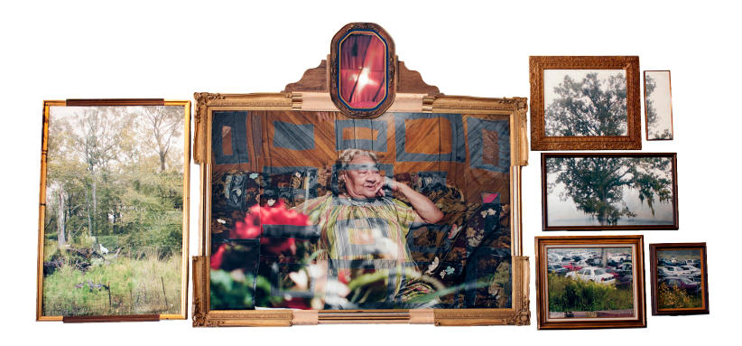
Letitia Huckaby East Feliciana Altarpiece , 2018 woodcut with mylar 46 x 144 inches (overall) Courtesy of the artist